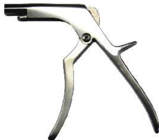
Handle for ERT Rongeur with return function 41.000.02